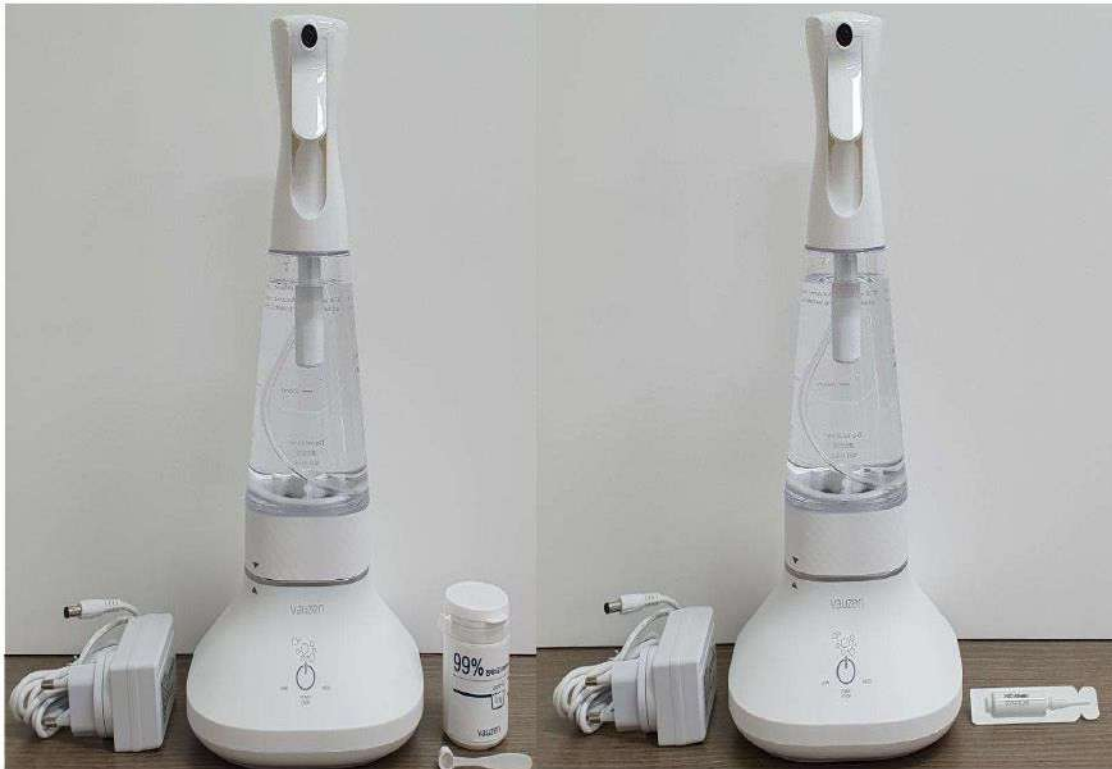
Fig1. [redacted] CO., LTD. Disinfectant (VSP-A62_salt), (VSP-A62_HOCl activator)

The sample was provided by the client [redacted], LTD. disinfectant (VSP-A62_salt), (VSP-A62_HOCl activator)